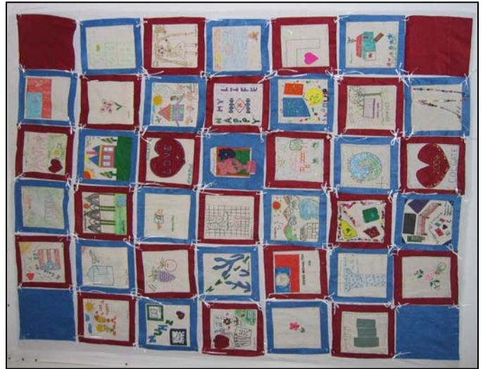
A display at the Mohawk Valley Resource Center for Refugees in Utica, New York

The goals of their project are to discover the deep cultural issues that may contribute to the miscommunication between American health care providers and international refugees and to